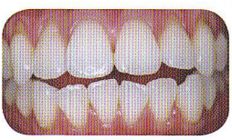
Individual patient results may vary.